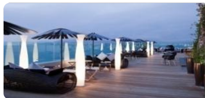
Thermes marins de Cannes Cannes/ France