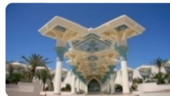
Hasdrubal hotel group, Tunisia