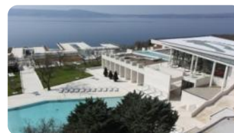
Novi Resort, Novi Vinodolski/ Croatia