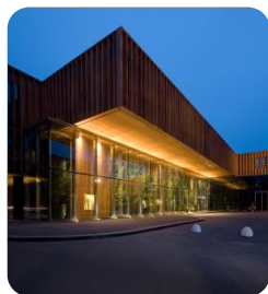
Barvikha Hotel & Spa, Moscow/ Russia