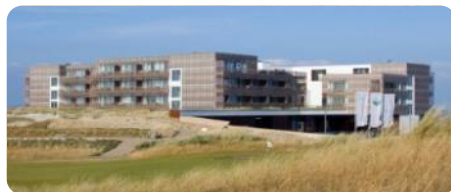
Budersand Hotel - Golf & Spa Sylt/ Germany