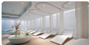
Porto Platanias Beach Resort & Spa, Crete/ Greece