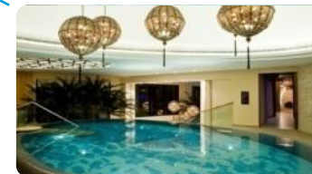
Sofitel Zallaq Thalassa Sea & Spa Bahrain