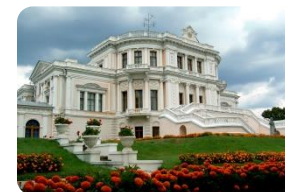
Sanatorium Marino, Kursk/ Russia