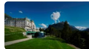
Kronenhof Pontresina/ Switzerland