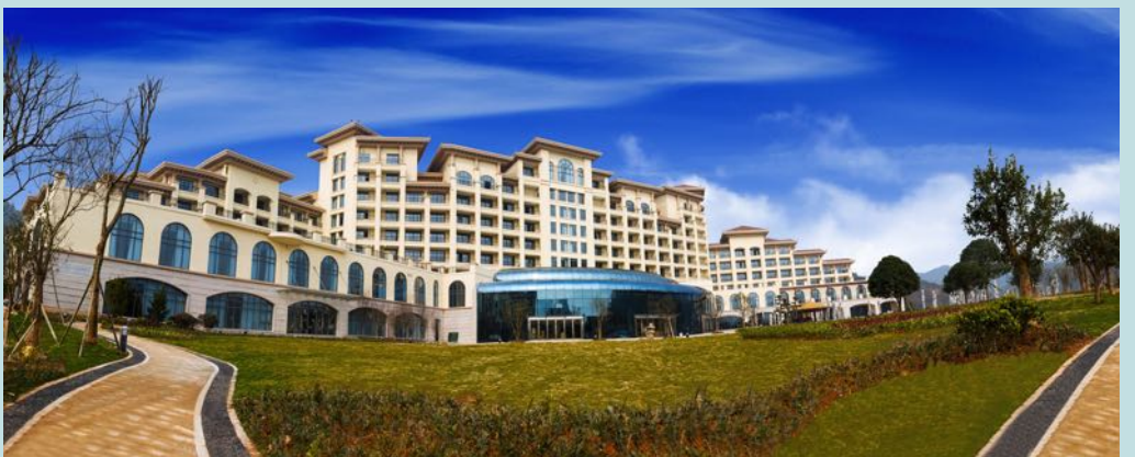
PIC 1: MINGYUESHAN NATIONAL FOREST PARK