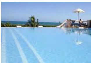
Cayo Santa Maria, Cuba