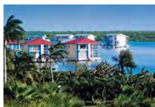
Cayo Coco, Cuba