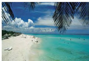
Playa de Varadero, Cuba