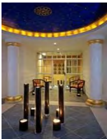
YHI SPA, Cuba