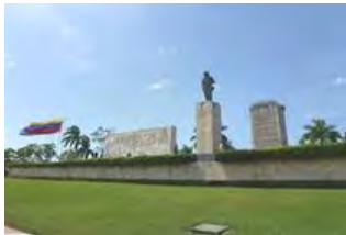
El "Che" Guevara, Santa Clara, Cuba