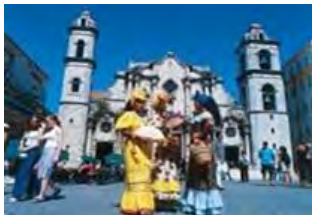
Plaza de la Catedral, La Habana